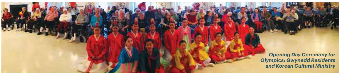
Opening Day Ceremony for Olympics: Gwynedd Residents and Korean Cultural Ministry