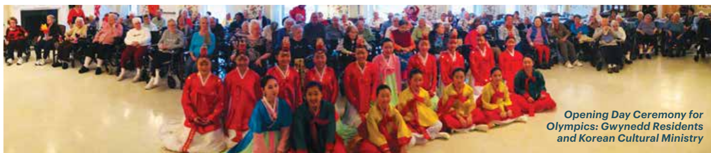
Opening Day Ceremony for Olympics: Gwynedd Residents and Korean Cultural Ministry